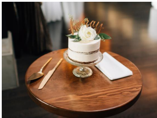
The Lake House